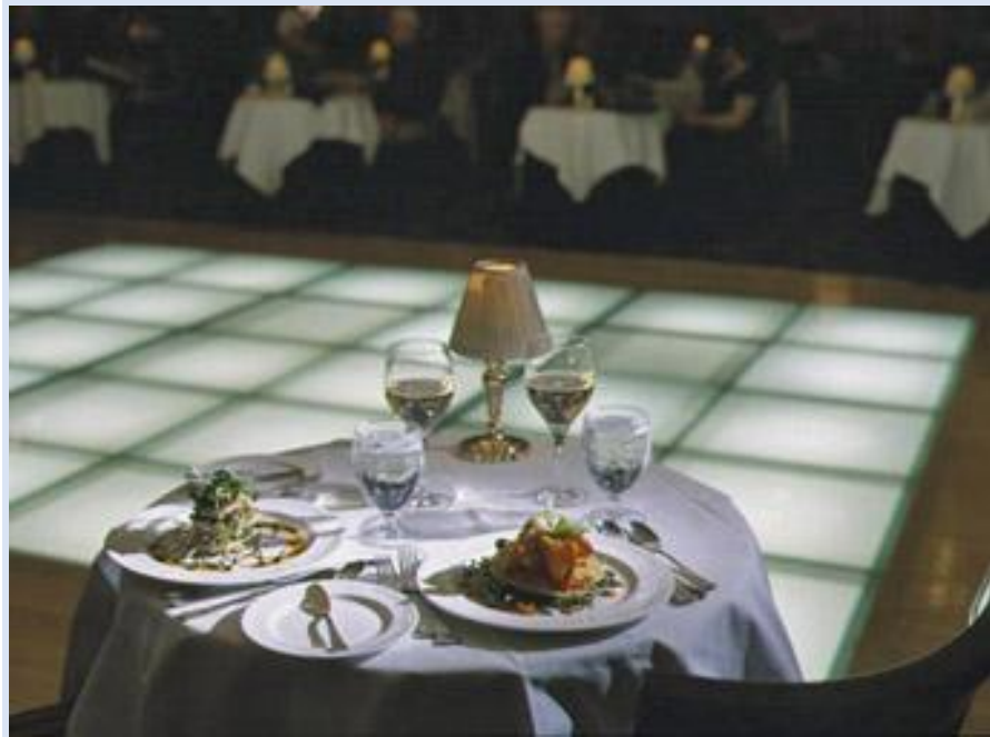
Gala Dinner & Dance Copper Room - Harrison Hotsprings Resort

British Columbia Bed & Breakfast Innkeepers Guild September 8, 2011